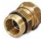
VDA100 External thread

ESBE draining valves for boilers, hot water tanks, pipes etc. Opens automatically when connecting a hose nipple.